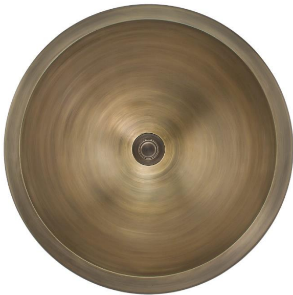
SHOWN IN AB

Linkasink warranties our product to be free from manufacturing defect for the life of the product. Warranty does not cover improper care or abuse/neglect, or changes to the living finish.