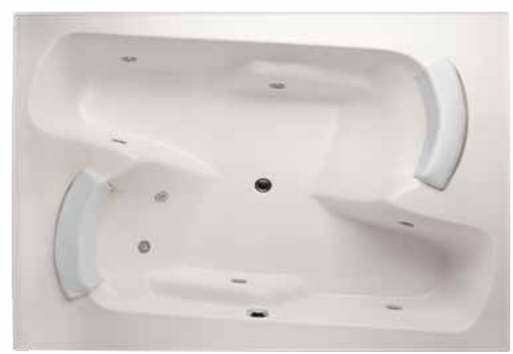
Must be set in Mortar Base