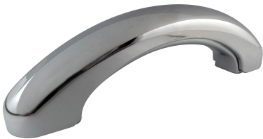
Standard Grab Bar