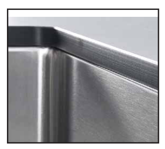
Foster Brushed finish

The exclusive finishes are the result of diligent research, the aim being to achieve the perfect combination between good looks and functionality. A distinctive feature, a true trademark that makes our products stand out for the ease with which they can be cleaned