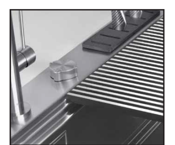
3 different levels

Leonardo sink has an ingenious design that makes it simple to use a large set of optional accessories.