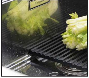
Third supporting step

It is on the bottom of the quadra bowl. On this step rest the Black grids when placed on the bottom of the bowl. They can also support pots and dishes, preventing the scratching of the steel surface of the sink underneath.