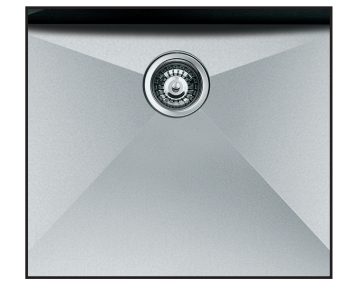
Diamond shaped bottom

The exclusive finishes are the result of diligent research, the aim being to achieve the perfect combination between good looks and functionality. A distinctive feature, a true trademark that makes our products stand out for the ease with which they can be cleaned