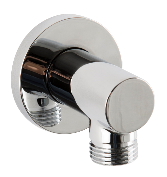
INLET/OUTLET 1/2" Female NPT Inlet